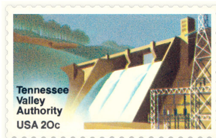
The Tennessee Valley Authority (TVA) was made possible by financing from the RFC.

Like the RFC was for FDR in 1933, the CEFC is the flexible option to start directing credit into an industrial renaissance immediately. As Australia comes through the pandemic and life and Parliament return to normal, Parliament should legislate a full national bank that can absorb the expanded CEFC.